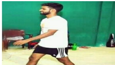
Jaffna Badminton team